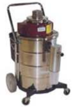
MRS 1 - for liquid mercury recovery (Includes Separator)